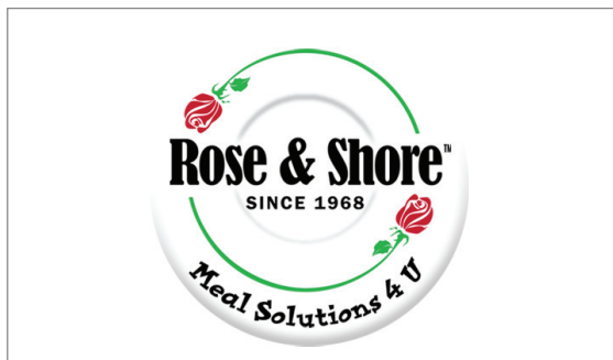
Rose & Shore